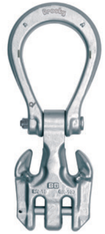
A-1362 Single Hook