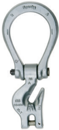
A-1361 Single Hook