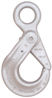
S-1316 Eye Hook