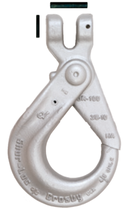
S-1317 Clevis Hook