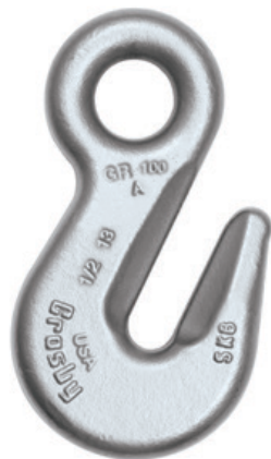
A-1328 Eye Grab Hook