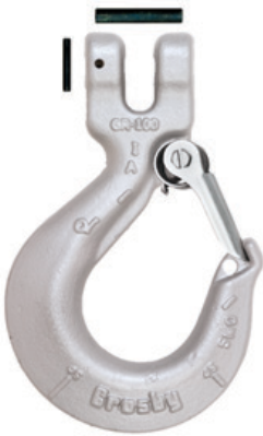
L-1339 Clevis Sling Hook