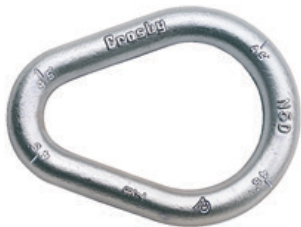
G-341 / S-341 Weldless Sling Link

*Based on single leg sling (in-line load), or resultant load on multiple legs with an included angle less than or equal to 120°. Minimum Ultimate load is 5 times the Working Load Limit. †† Welded Link.