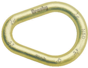
A-341 Alloy Pear Shaped Links