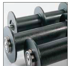
Different drum designs

Available in corrosion proof version on request!