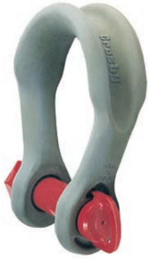
G-2160 / S-2160